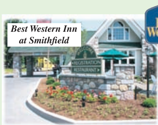
Best Western Inn at Smithfield