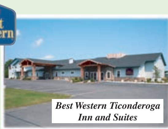
Best Western Ticonderoga Inn and Suites